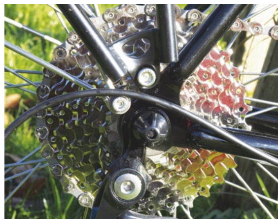
Above Carrier wants and gets a bigger (M6) bolt

The wheels are handbuilt in Harrogate and the rear has differential spoking. That means thicker spokes on the right, where dishing ▶▶